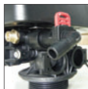
QC Drain Line