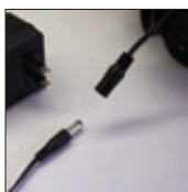
QC Power Cable