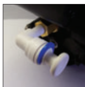
QC Brine Line